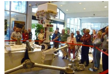
The Mars Rover model on display