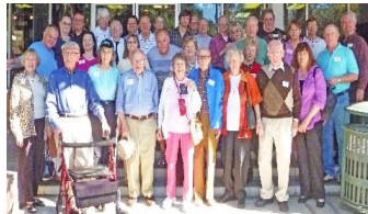
Deers and deers.