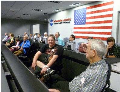
Our group in the control room. Houston we REALLY have a problem now.